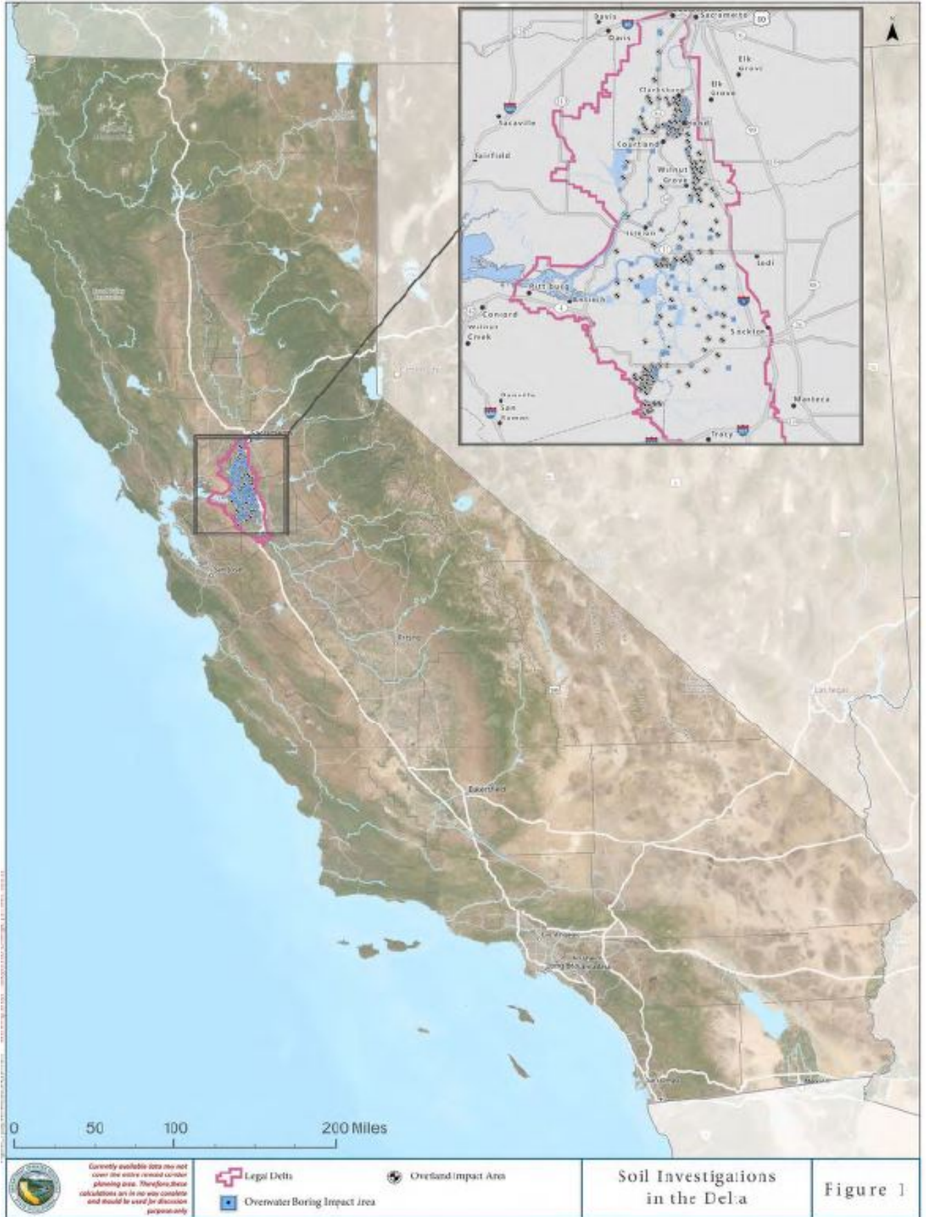
1) Vicinity map